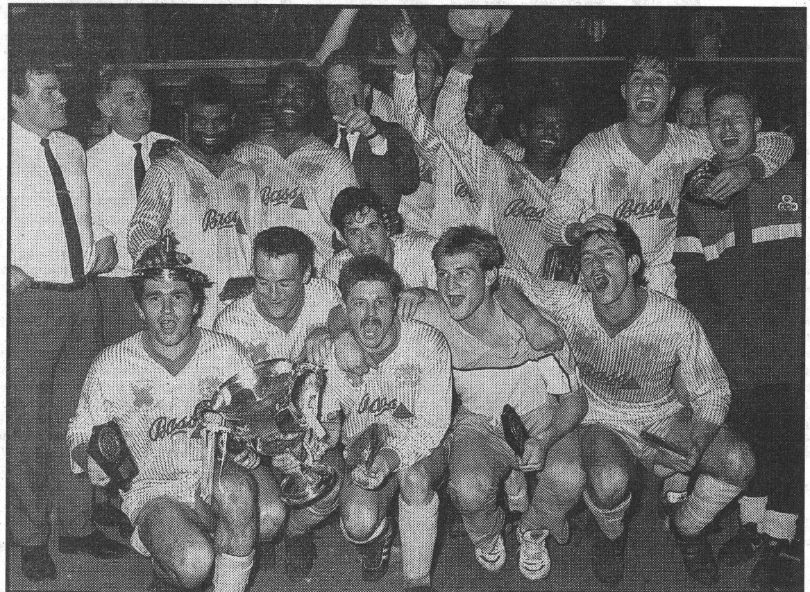
"WE'VE WON the cup". Yeovil Town players celebrate after their 4-1 aggregate win over Kidderminster in the final of the Bob Lord Trophy last night.