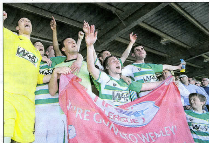
FANS' FAVOURITES: Yeovil Town players celebrate with supporters at Huish Park after their npower One Play-Off semi-final second-leg victory over Sheffield United