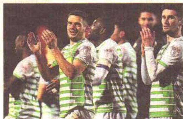
ON A ROLL Yeovil stars celebrate Cup victory over Bradford BY ADRIAN KAJUMBA